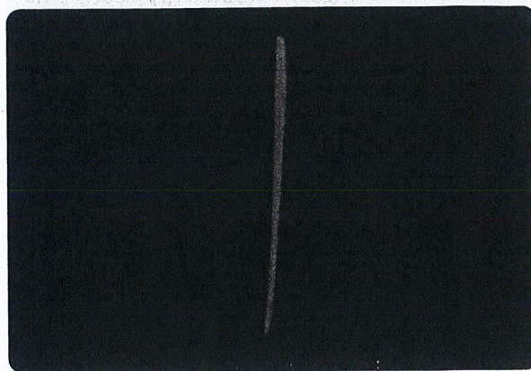
Figure 3 The spectrum of sodium