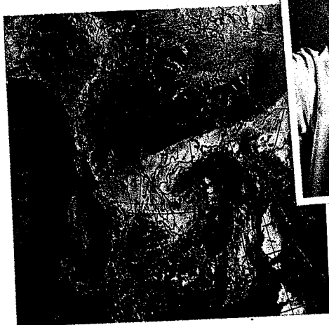
Figure 2.14 These models were made to help people understand or analyze complex systems, organisms, or events. Do any of these models simplify or distort the organism, item, or system they are representing? If so, how and why?

A scientific theory is an explanation of a phenomenon in the natural world based on many observations and investigations. Theories can be, and often are, modified or discarded if new experimental data arise that contradict the theory or that the