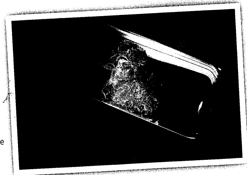
DNA from a laboratory sample