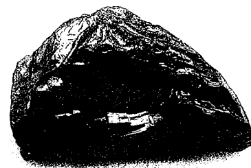
Figure 4 Silicon has qualities of both a metal and a non-metal.

A few elements do not fit exclusively into either group and are called metalloids (semi-metals or semiconductors). Silicon, germanium, arsenic, antimony, and tellurium exhibit some of the qualities of both metals and non-metals. For instance, silicon is shiny and a solid at room temperature (like a metal) but is a poor conductor of electricity and is brittle (like a non-metal) (Figure 4). Many of the metalloids are semiconductors of electricity, meaning that they have a partial ability to conduct electricity—from almost no ability to full conductivity. This property is useful in the electronics industry and has made the metalloids a very important group in today's world.